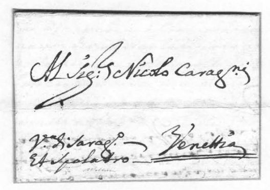
1749 10. June. Courier entire letter from Salonique to Venice. On the front in manuscript "via di Saraglio et Spalato".